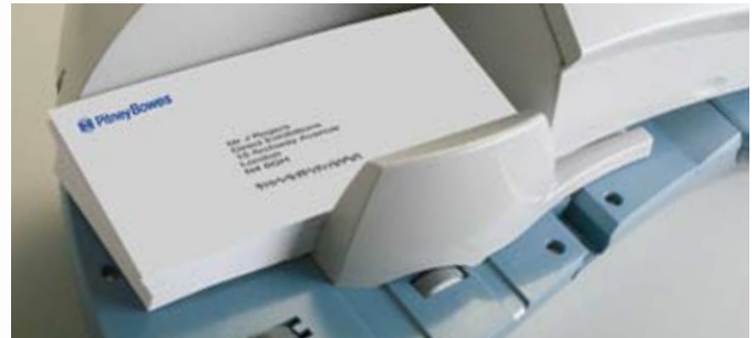
Automatic feeder quickly processes your mail