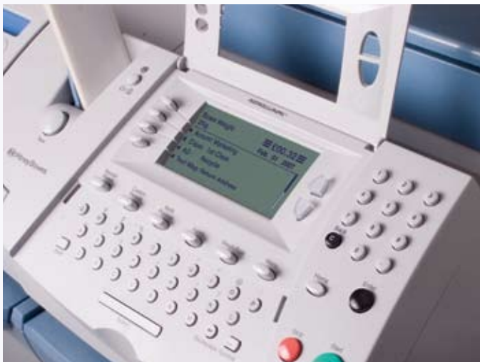
Easily add a custom text message with the qwerty keyboard

Transform your mail piece into eye-catching communications. Advertise your business on every mail piece with sharp inkjet printing to build your professional image. An optional feature allows you to print a return address or message alongside your customised slogan to ensure undelivered mail is returned thus improving the accuracy of your mailing database and ultimately reducing expenditure on subsequent mail shots. These are easily entered via a built-in qwerty keyboard.